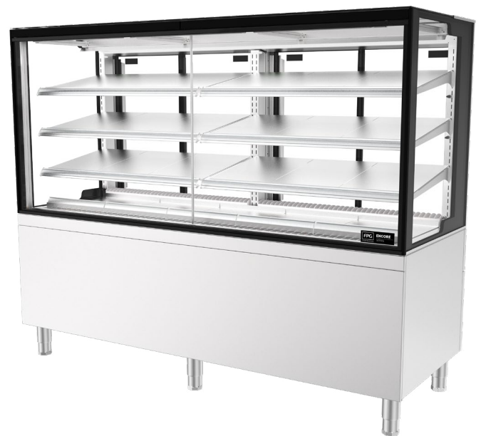
Showing: Encore Series 8 refrigerated 1800mm square freestanding tilt front with integral refrigeration