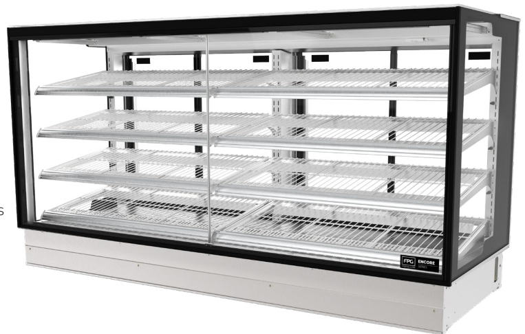
Showing : Encore Series 8 heated 1800mm square in-counter tilt front