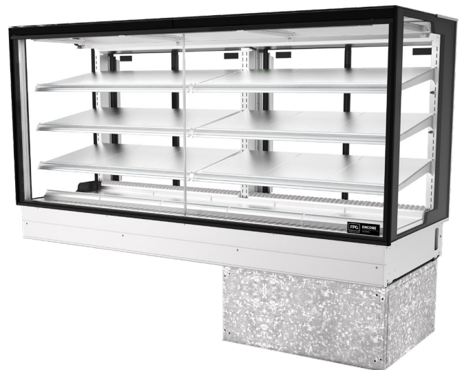
Showing : Encore Series 8 controlled ambient 1800mm square in-counter tilt front with integral refrigeration