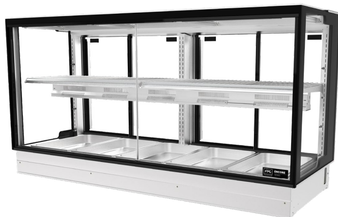
Showing : Encore Series 8 Bain Marie heated 1800mm square in-counter tilt front