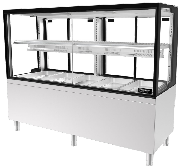
Showing : Encore Series 8 Bain Marie heated 1800mm square freestanding tilt front