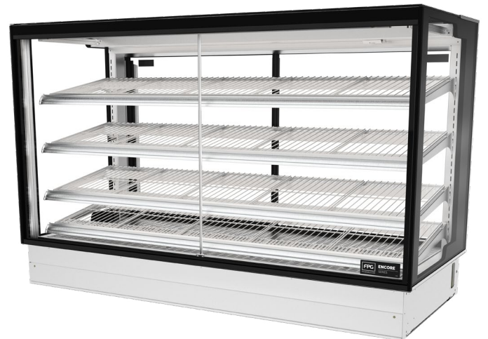
Showing : Encore Series 8 heated 1500mm square in-counter tilt front