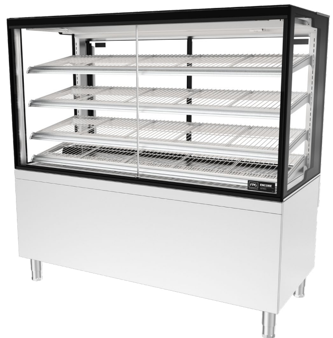
Showing : Encore Series 8 heated 1500mm square freestanding tilt front