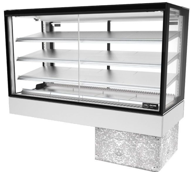
Showing : Encore Series 8 controlled ambient 1500mm square on-counter tilt front with integral refrigeration