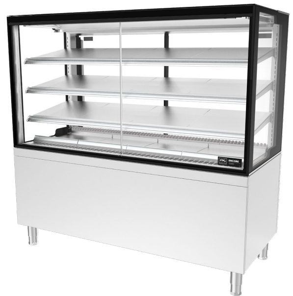
Showing : Encore Series 8 controlled ambient 1500mm square freestanding tilt front with integral refrigeration