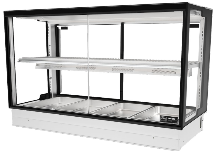
Showing : Encore Series 8 Bain Marie heated 1500mm square in-counter tilt front