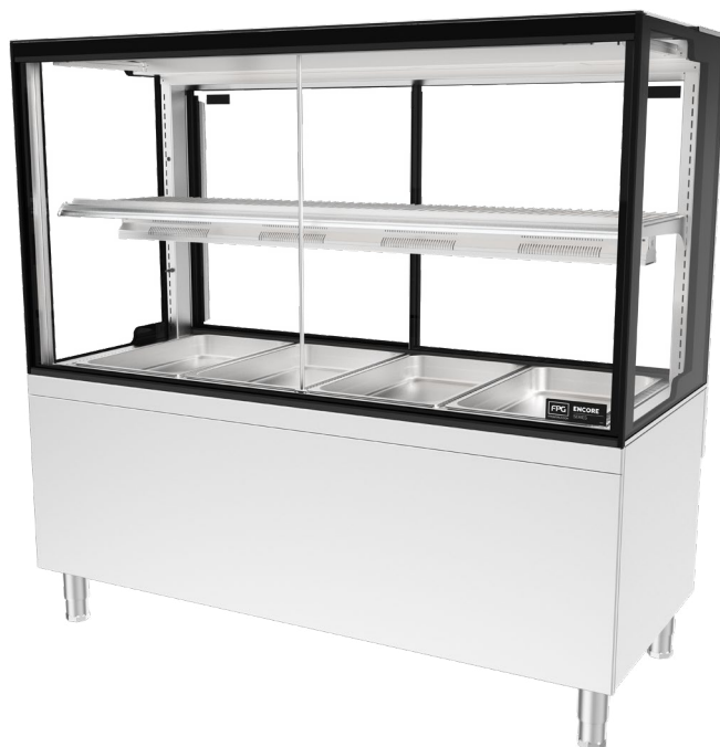
Showing : Encore Series 8 Bain Marie heated 1500mm square freestanding tilt front