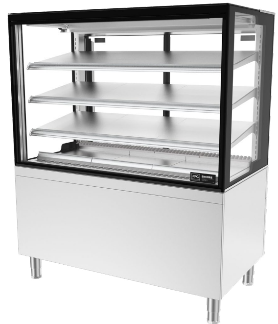
Showing : Encore Series 8 controlled ambient 1200mm square freestanding tilt front with integral refrigeration