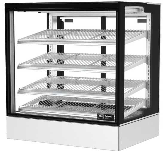
Showing : Encore Series 8 heated 900mm square on-counter tilt front