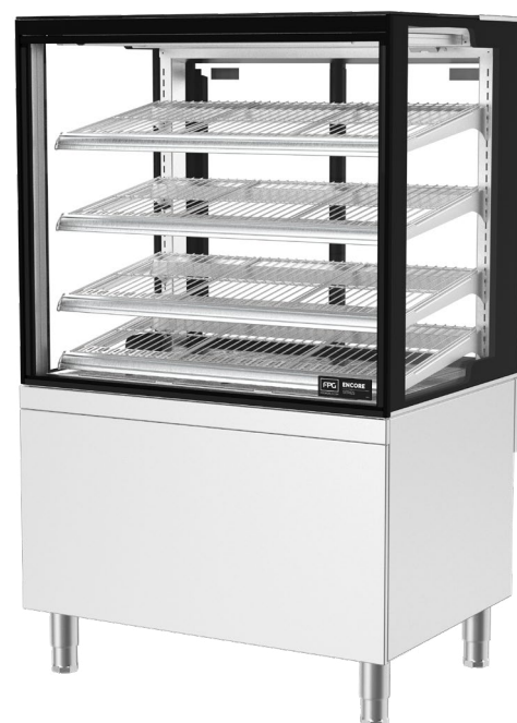
Showing : Encore Series 8 heated 900mm square freestanding tilt front