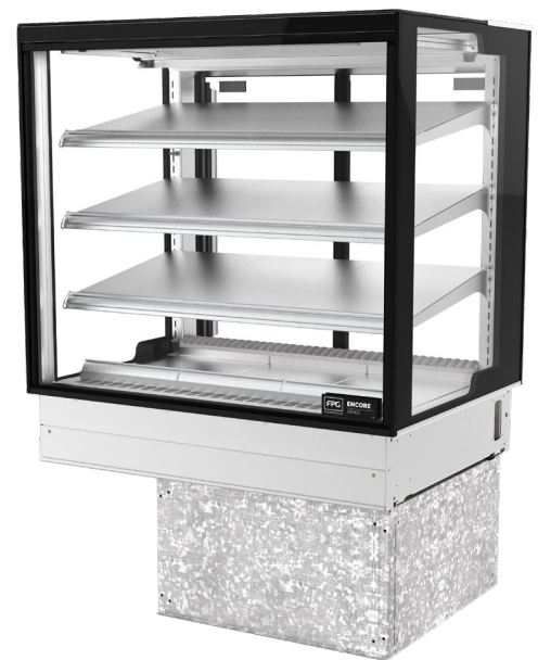
Showing : Encore Series 8 controlled ambient 900mm square in-counter tilt front with integral refrigeration