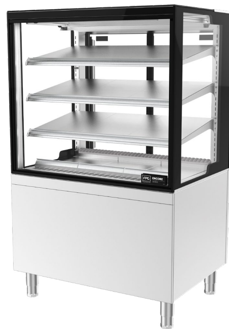
Showing : Encore Series 8 controlled ambient 900mm square freestanding tilt front with integral refrigeration