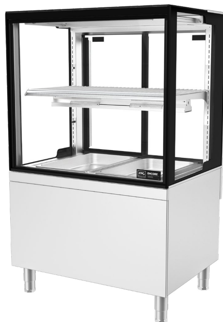
Showing : Encore Series 8 Bain Marie heated 900mm square freestanding tilt front