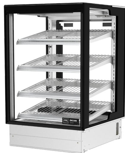
Showing : Encore Series 8 heated 600mm square in-counter tilt front