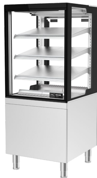
Showing : Encore Series 8 controlled ambient 600mm square freestanding tilt front with integral refrigeration