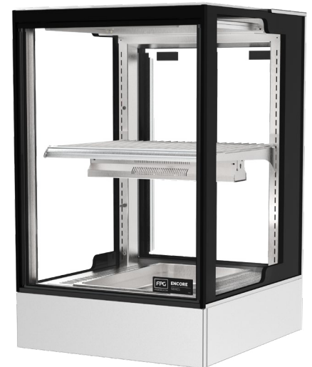
Showing : Encore Series 8 Bain Marie heated 600mm square on-counter tilt front