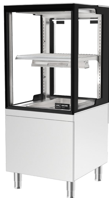
Showing : Encore Series 8 Bain Marie heated 600mm square freestanding tilt front