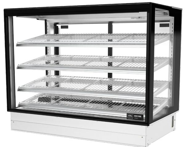
Showing : Encore Series 8 heated 1200mm square in-counter tilt front