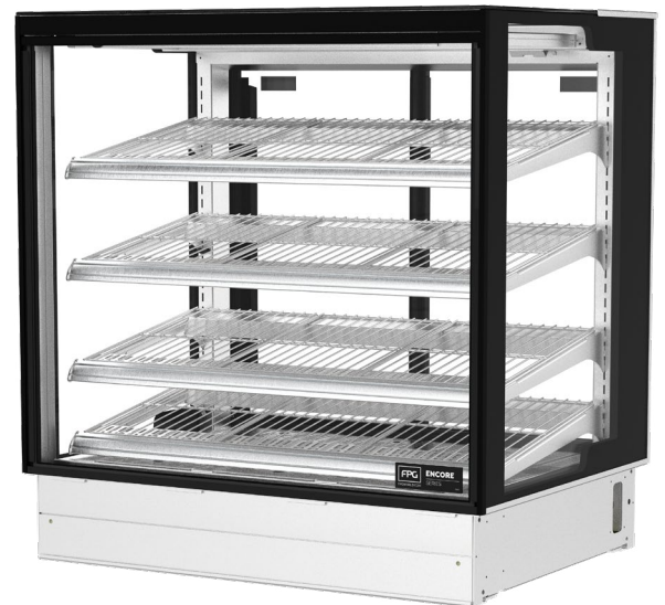
Showing : Encore Series 8 heated 900mm square in-counter tilt front