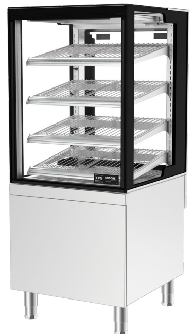
Showing : Encore Series 8 heated 600mm square freestanding tilt front