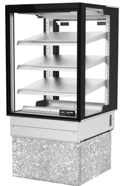
Showing : Encore Series 8 controlled ambient 600mm square in-counter tilt front with integral refrigeration