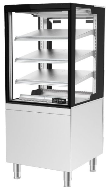
Showing : Encore Series 8 controlled ambient 600mm square freestanding tilt front with integral refrigeration