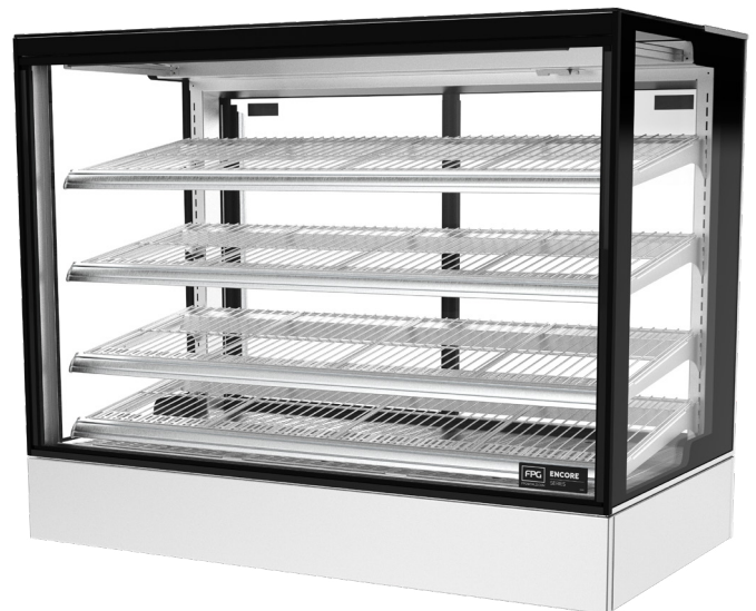
Showing : Encore Counter heated 1200mm square on-counter tilt front