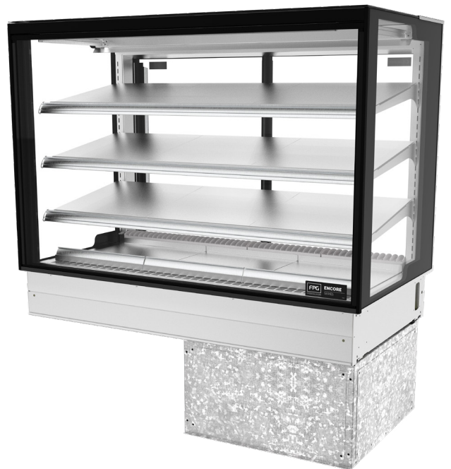
Showing : Encore Counter controlled ambient 1200mm square in-counter tilt front with integral refrigeration