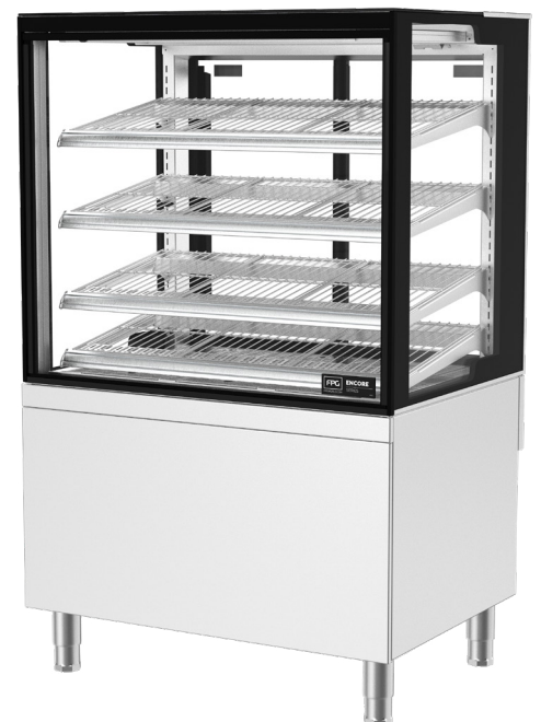
Showing : Encore Counter heated 900mm square freestanding tilt front