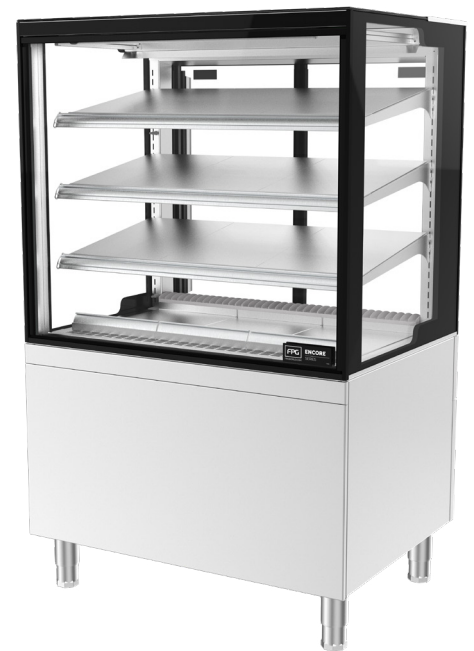
Showing : Encore Counter controlled ambient 900mm square freestanding tilt front with integral refrigeration