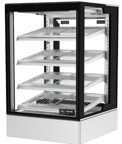
Showing : Encore Counter heated 600mm square on-counter tilt front