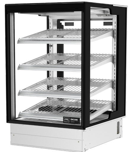
Showing : Encore Counter heated 600mm square in-counter tilt front