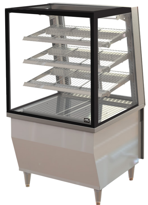
Showing : Inline 5000 Series heated 800mm square freestanding fixed front