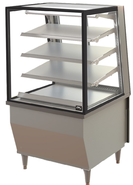
Showing : Inline 5000 Series refrigerated 800mm square freestanding fixed front with integral refrigeration