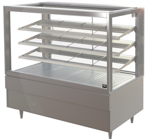
Showing : Inline 4000 Series heated 1500mm square freestanding with fixed front