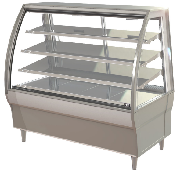
Showing : Inline 4000 Series refrigerated 1500mm curved freestanding fixed front with integral refrigeration