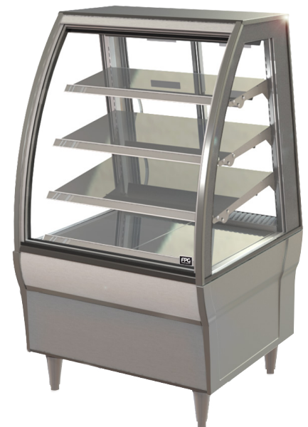
Showing : Inline 4000 Series refrigerated 800mm curved freestanding fixed front with integral refrigeration