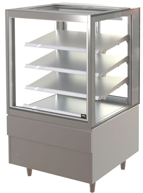
Showing : Inline 4000 Series ambient 800mm square freestanding fixed front