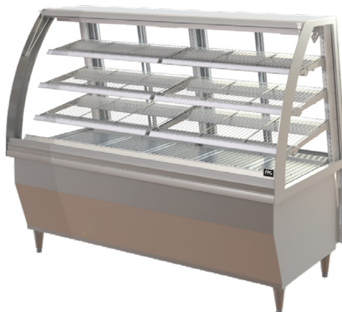
Showing : Inline 5000 Series heated 1800mm curved freestanding tilt front