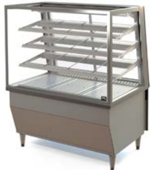
Showing : Inline 5000 Series heated 1200mm square freestanding fixed front