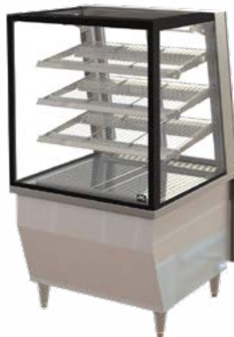
Showing : Inline 5000 Series heated 800mm square freestanding fixed front