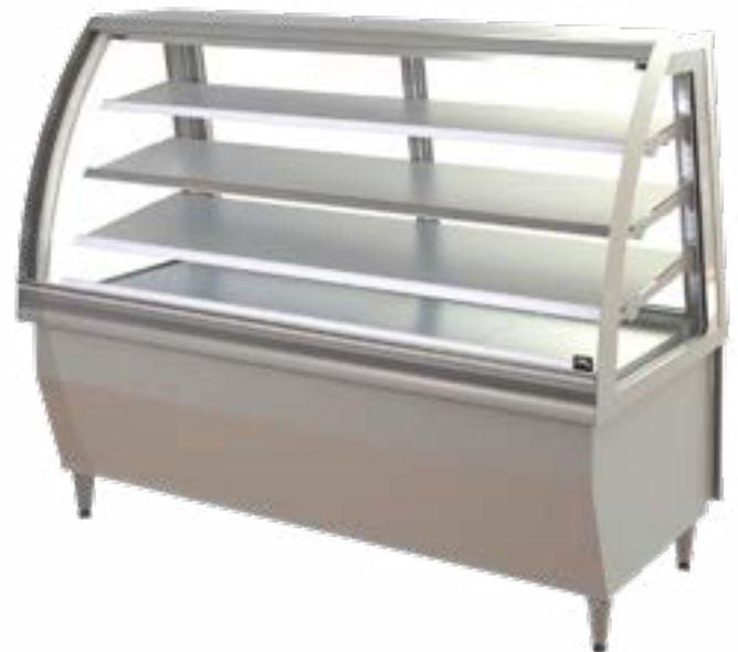
Showing : Inline 5000 Series controlled ambient 1800mm curved freestanding tilt front with integral refrigeration