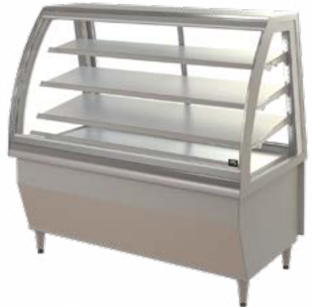
Showing : Inline 5000 Series controlled ambient 1500mm curved freestanding tilt front with integral refrigeration