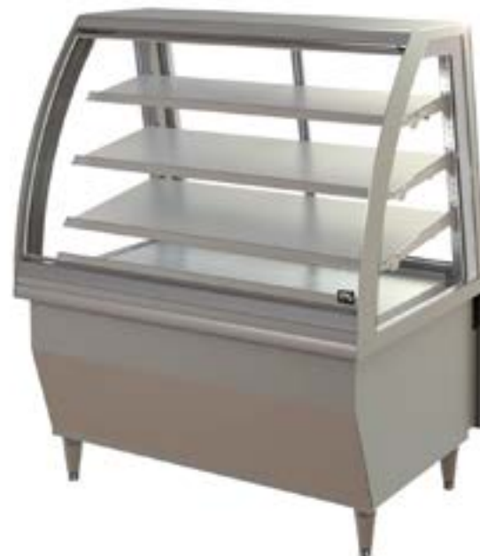
Showing : Inline 5000 Series controlled ambient 1200mm curved freestanding tilt front with integral refrigeration