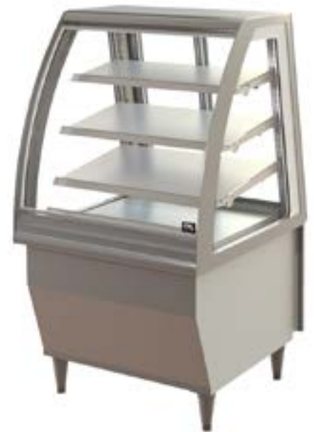
Showing : Inline 5000 Series controlled ambient 800mm curved freestanding tilt front with integral refrigeration