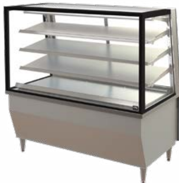
Showing : Inline 5000 Series refrigerated 1500mm square freestanding fixed front with integral refrigeration