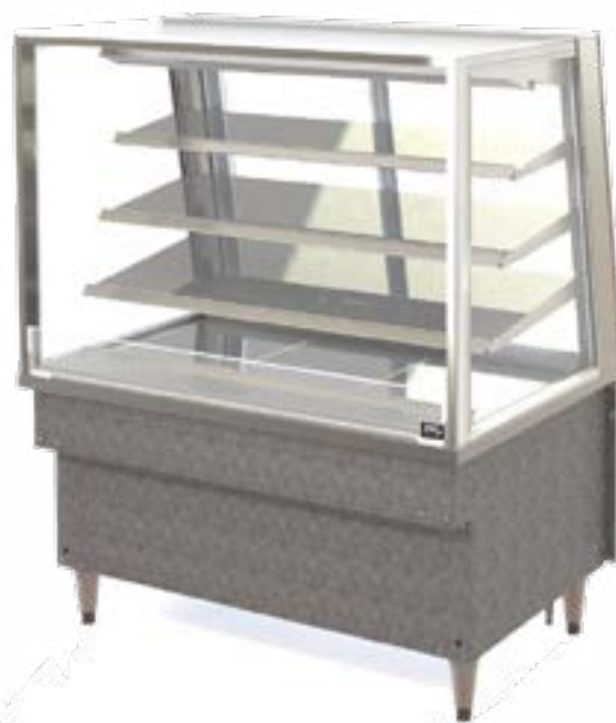
Showing : Inline 5000 Series refrigerated 1200mm square freestanding open front with integral refrigeration