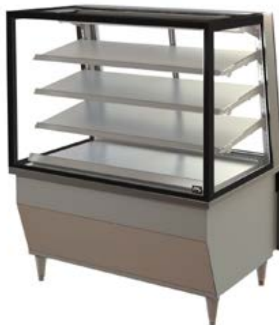
Showing : Inline 5000 Series refrigerated 1200mm square freestanding fixed front with integral refrigeration