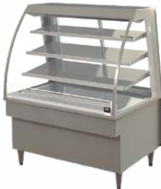
Showing : Inline 5000 Series refrigerated 1200mm curved freestanding open front with integral refrigeration