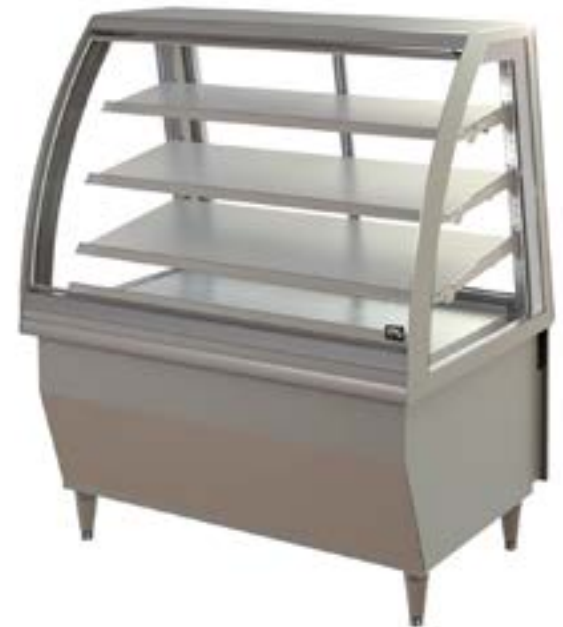
Showing : Inline 5000 Series refrigerated 1200mm curved freestanding tilt front with integral refrigeration